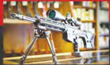
Large Firearm Selection